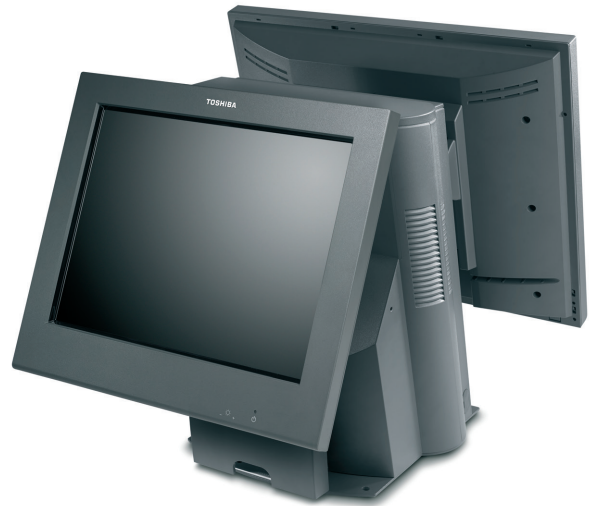
Shown: Independent customer display (12" display) delivers customer information and digital, multi-media merchandising (optional)