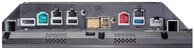
Selectable and upgradeable SurePorts enable retailers to use existing devices and connect customer or employee devices