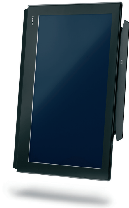
Kiosk configuration portrait viewing