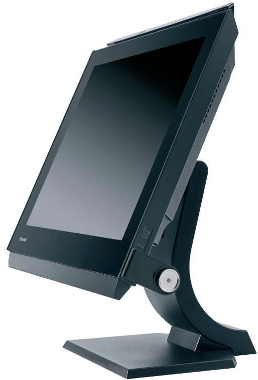
Countertop configuration with optional stand