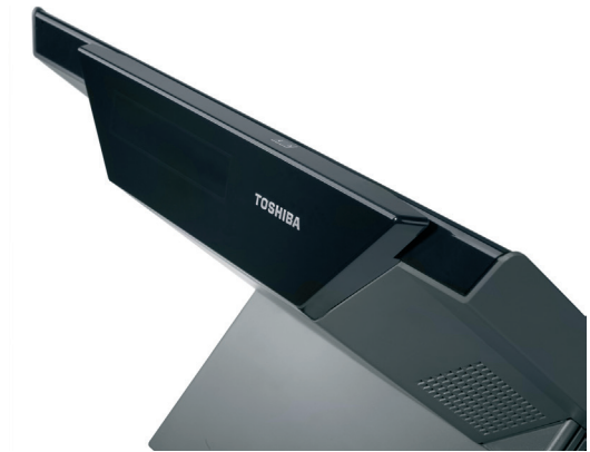
Optional MSR and/or customer display